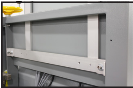
Developed and constructed with heavy duty components for long lasting performance