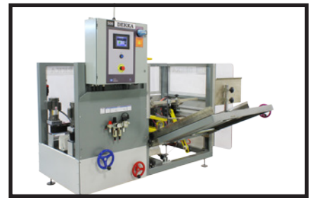
Compact design allows machine to fit in small operations