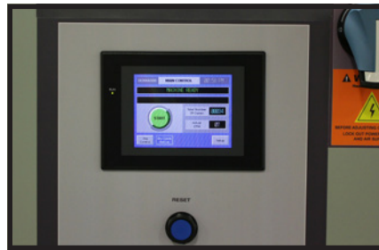
Full color 5" HMI touchscreen for easy and intuitive machine operation