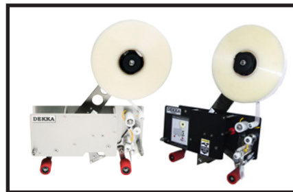
Reliable case sealing with the industry leading high performance Dekka tape head