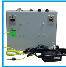
Battery Conversion Kit