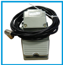
Dual Footswitch Kit