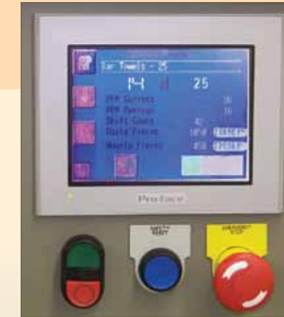
Interface panel shows correct product count.