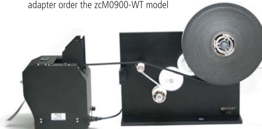
*SHOWN WITH THE TDA080