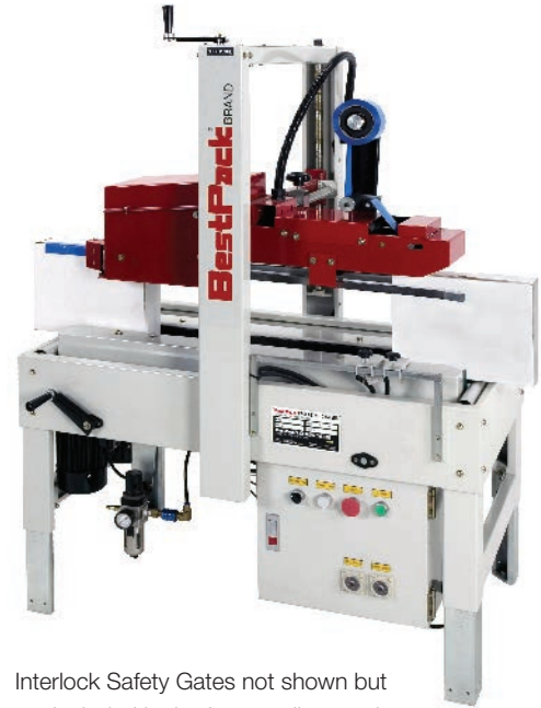
Interlock Safety Gates not shown but are included in the front sealing section.

The MS1E is available with a 2" Pneumatic High Speed BestPack Tape Head. All units are available in standard baked enamel finish and food grade 304 stainless steel for 21 CFR 110 compliance.