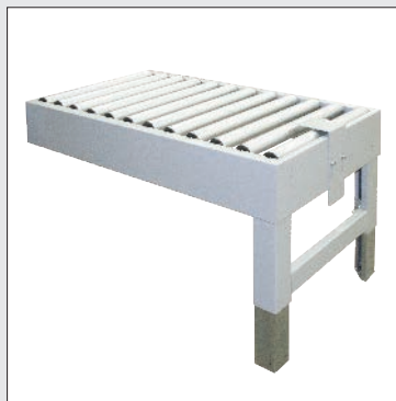
Infeed/Exit Conveyor w/ L-Bracket Holder/Stopper