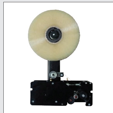
Spare Tape Head