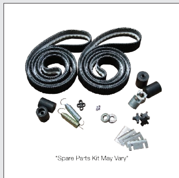
Spare Parts Kit