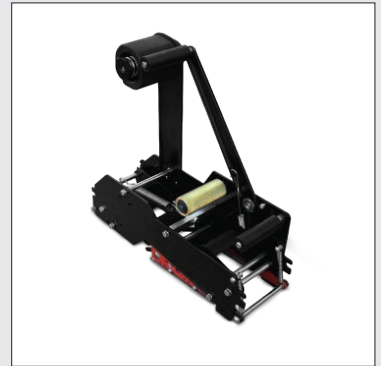
Spare Tape Head