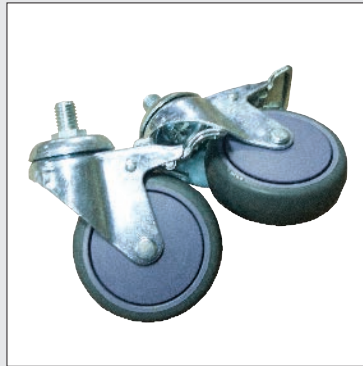
Locking Casters w/ Support Brackets