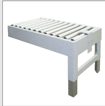
Long Exit Conveyor w/ L-Bracket Holder/Stopper