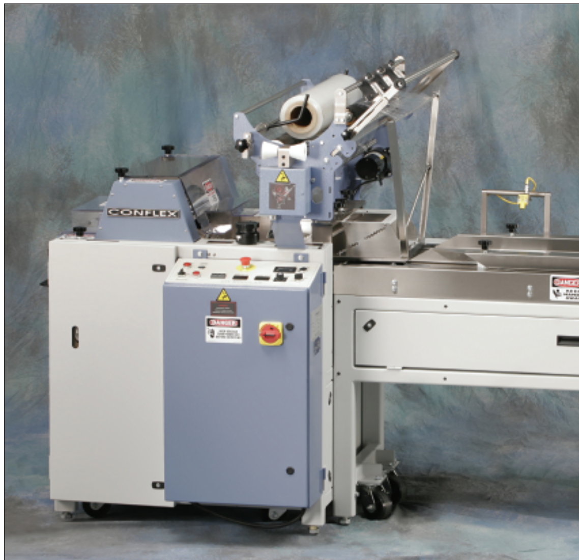
CW-160 modular shown

Efficient, Reliable, Flexible. Capable of Processing Up to 200 Packages Per Minute!