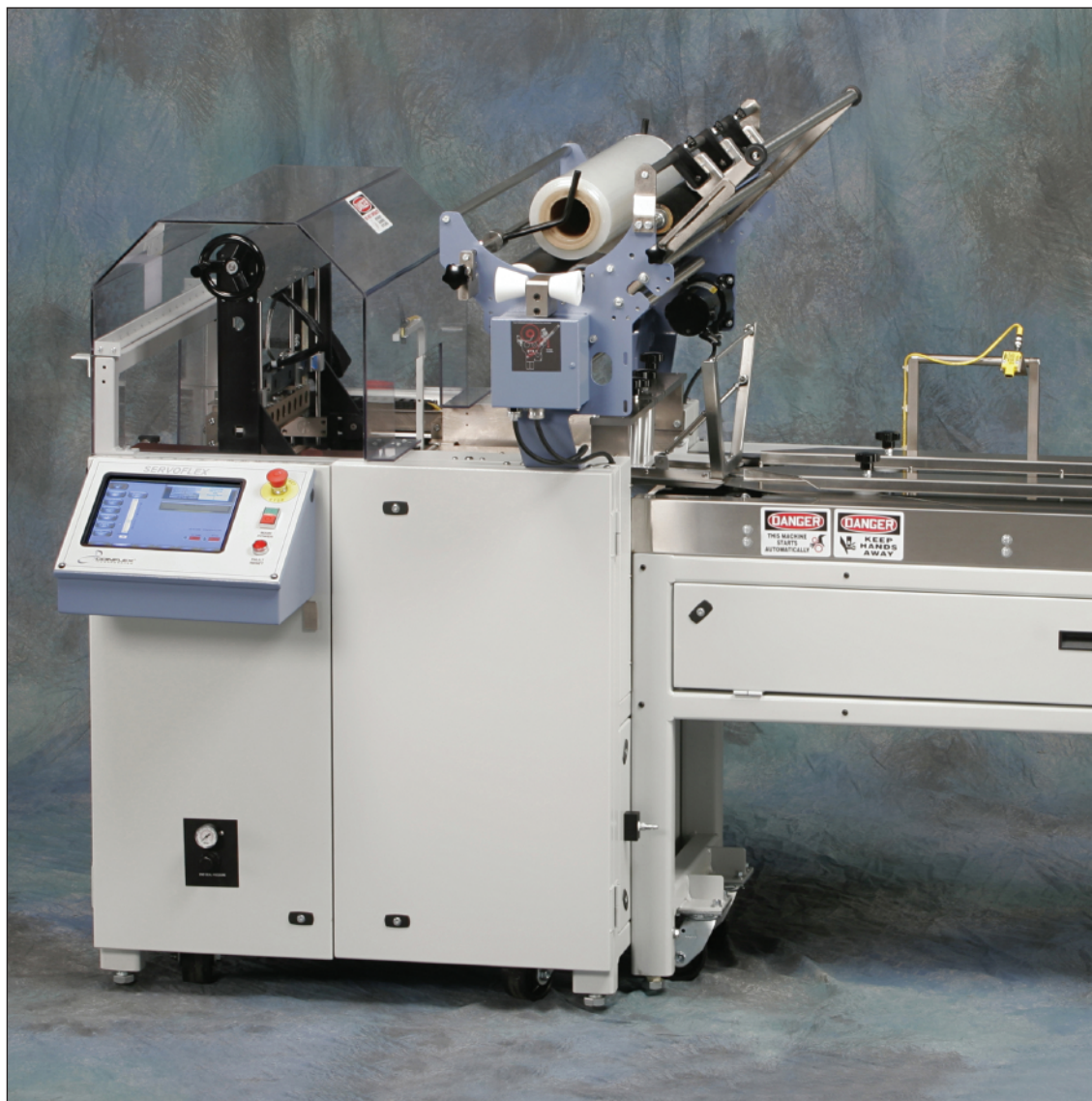
ServoFlex modular shown

Innovative Design Incorporates Servo Technology for the Ultimate Performance and Flexibility