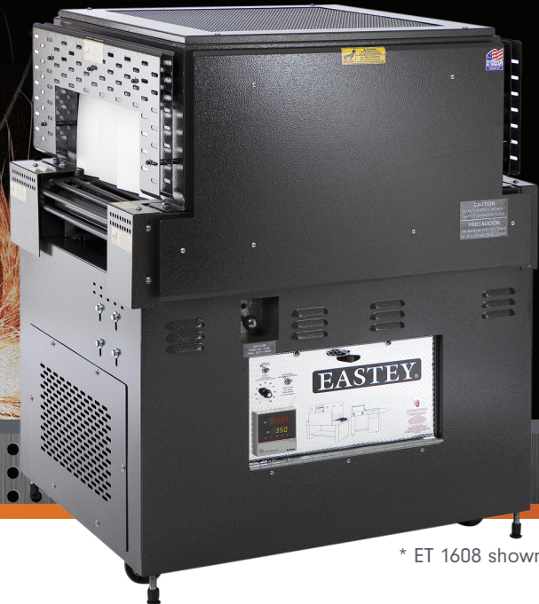
* ET 1608 shown