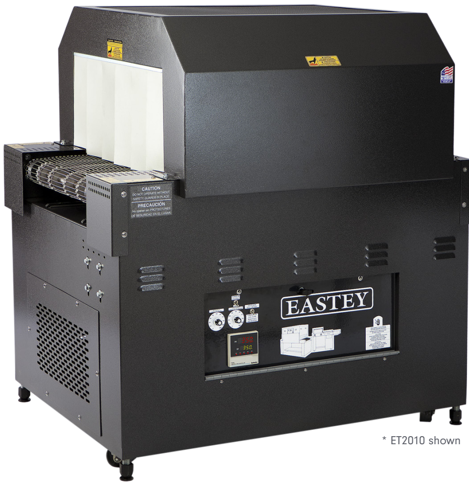
* ET2010 shown