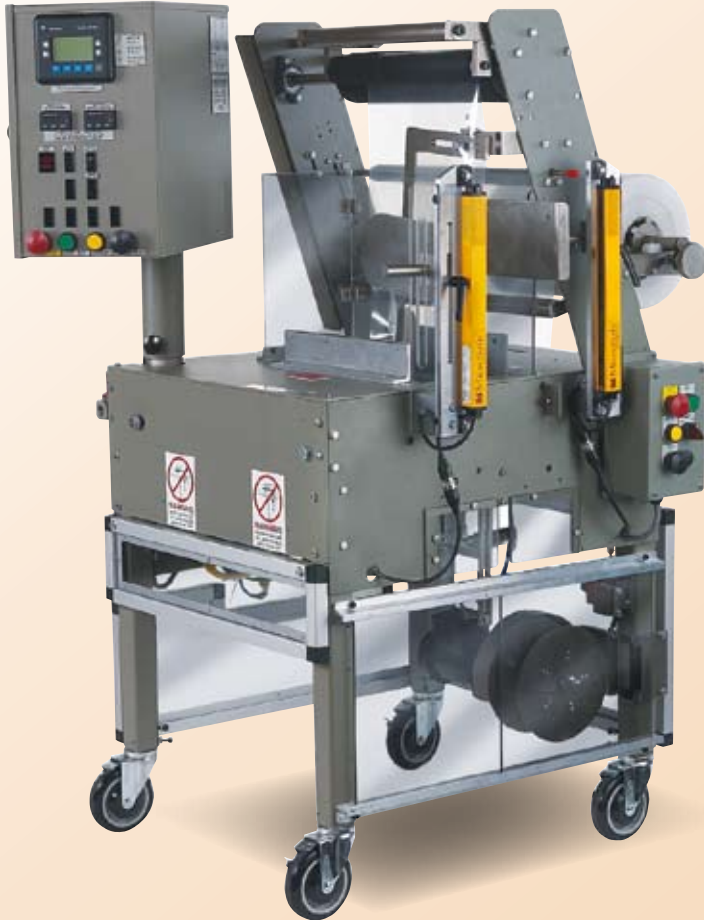
Standard Seal Assembly Horizontal Seal Above Vertical Seal